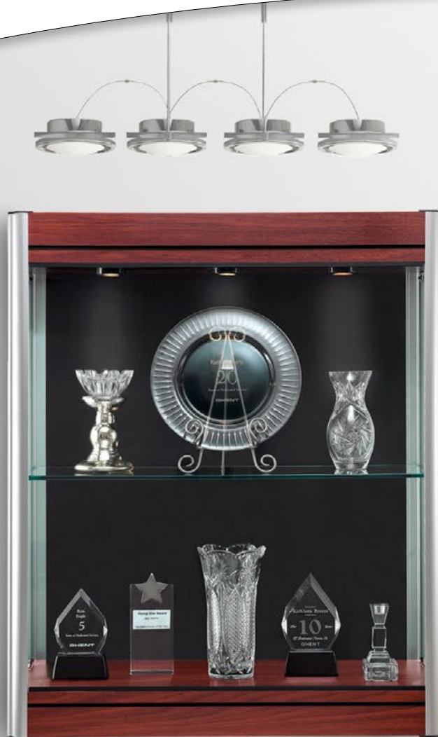
In this picture: 603 wall case with cherry laminate finish with black laminate backing and satin natural frame.