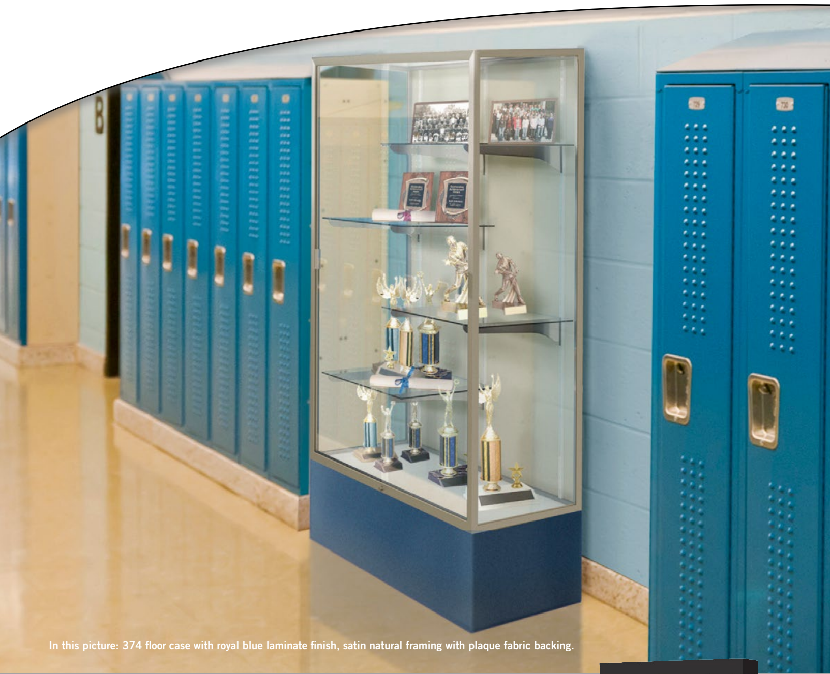
In this picture: 374 floor case with royal blue laminate finish, satin natural framing with plaque fabric backing.