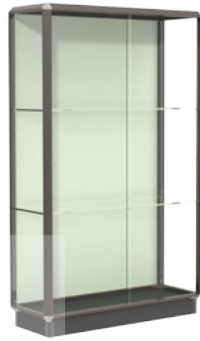
441 | 445 - floor case (pictured in dark bronze)

aluminum framed case with 2 full-sized adjustable shelves, hinged tempered glass door with lock, and adjustable floor levelers 77"H x 28"W x 28"D shipping - 215 lbs