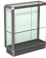
443 - countertop case (pictured in dark bronze)

aluminum framed case with 2 full-length adjustable shelves 78"H x 24"W x 24"D shipping - 197 lbs