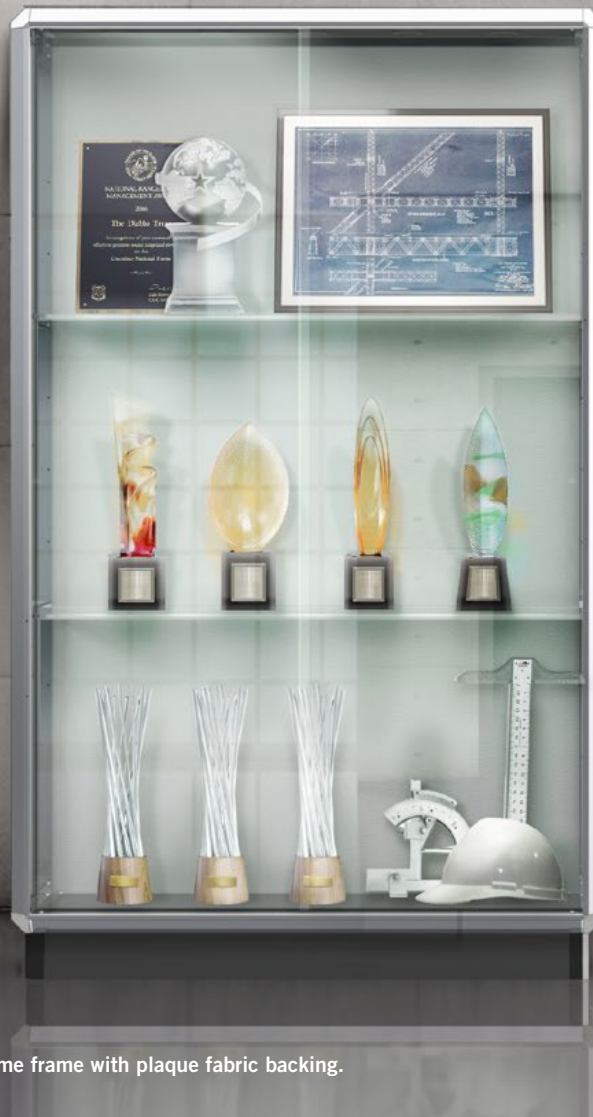
In this picture: 441 floor case with chrome frame with plaque fabric backing.