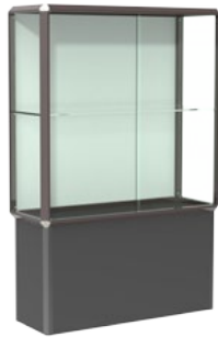
449 | 450 - 4' spotlight case (pictured in dark bronze)

aluminum framed case with 2 full-length adjustable shelves and locking access door in base 72"H x 24"W x 24"D shipping - 210 lbs