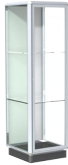
442 | 446 - corner case (pictured in chrome)

aluminum framed case with 2 full-length adjustable shelves 78"H x 48"W x 18"D shipping - 303 lbs