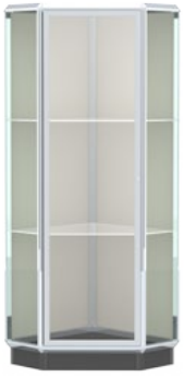
439 | 440 - corner case (pictured in chrome)

aluminum framed case with 2 full-sized adjustable shelves, hinged tempered glass door with lock, and adjustable floor levelers 77"H x 28"W x 28"D shipping - 215 lbs