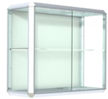
444 - wall case (pictured in chrome)

aluminum framed case with 1 full-length adjustable shelf 40"H x 36"W x 14"D shipping - 120 lbs